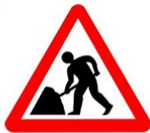
Man at work